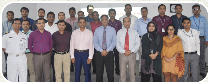
Chief Guest with the Instructor and Participants