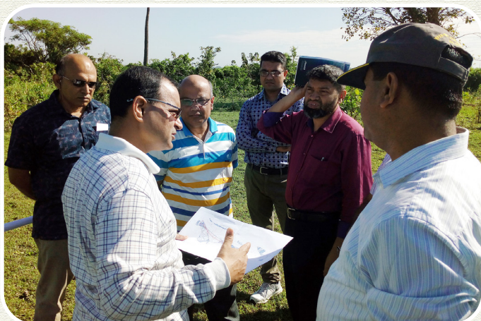
Both Teams of MIST and BSMRMU at Permanent Campus