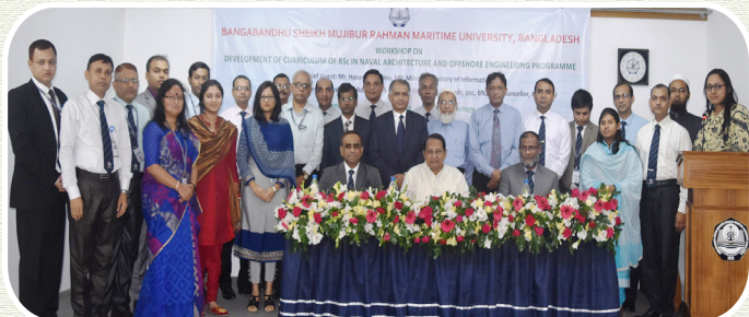
Chief Guest and Special Guest with Faculty Members and Other Officers