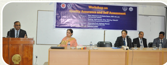
Speech by the Chief Guest