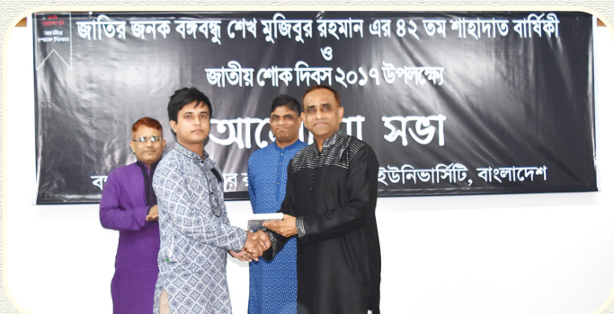
Awarding of Prize by Vice-Chancellor to the Best Essay Writer

The 42nd Death Anniversary of the Father of the Nation Bangabandhu Sheikh Mujibur Rahman and National Mourning Day 2017 was observed in BSMRMU on 15 Aug 17 with due reverence. To mark the day, a programme including Doa Mahfil, Essay Competition, Discussion Session and Display of a short film on the life and activities of Bangabandhu was arranged in the university campus. On the occasion, Vice-Chancellor was present as the Chief Guest and distributed prizes among the best essay writers. Among others, faculty members, students, officers and staffs of the university were also present. In the closing speech, the Vice-Chancellor told that we all should feel proud that our university has been named after the name of our Father of the nation. He also added that as the founder of a maritime nation like Bangladesh, Bangabandhu envisioned the future role of the Bay of Bengal and utilization of sea resources for