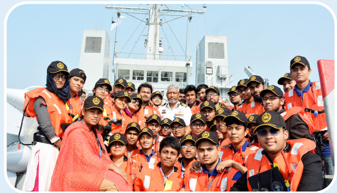
Students with Dean and other Faculty Members on board BN Survey Vessel