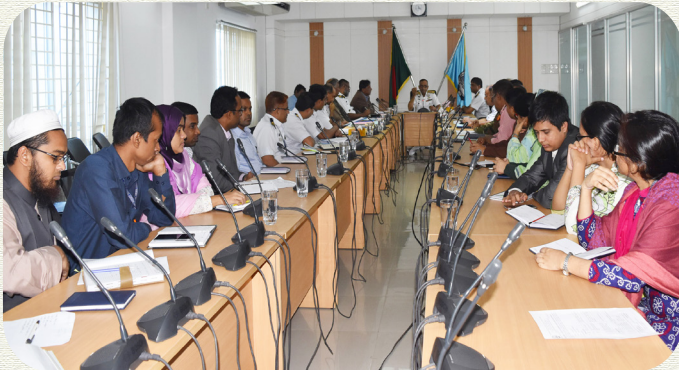
A Partial View of Co-ordination Meeting

The internal Co-ordination meetings of officers and teachers were held on 18 Oct 17 (39th) and 17 Dec 17 (40th) respectively. The Vice-Chancellor presided over the meetings. Various issues of common interests were discussed in these meetings as usual.