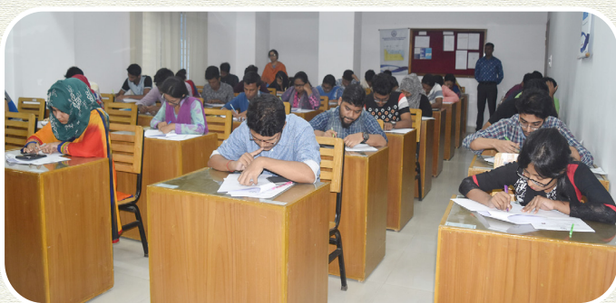
A Glimpse of Admission Test

The Admission Test of B Sc in Naval Architecture and Offshore Engineering (NAOE) and B Sc in Oceanography programme was held at the university campus on 05 Nov 17. A total of 780 candidates appeared in the Written Examination for both the programmes.