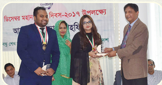
Chief Guest Handing over Awards to the Winners of Debate Competition