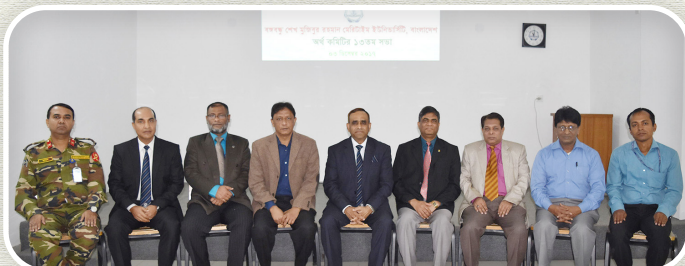
Members of the Finance Committee

The 13th meeting of Finance Committee was held on 03 Dec 17 at the university Conference Room. The Vice-Chancellor presided over the meeting. A number of financial matters were discussed and decisions were taken accordingly.