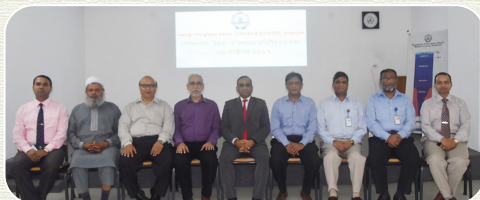
Members of Planning, Development and Evaluation Committee

The 5th meeting of Planning, Development & Evaluation committee was held on 09 Oct 17 at the Conference Room of the university. The Vice-Chancellor chaired the meeting. Various planning, development and evaluation related matters were discussed and decisions were taken accordingly. Among them, remarkable is the feasibility study of the land allotted for permanent campus of BSMRMU by MIST.