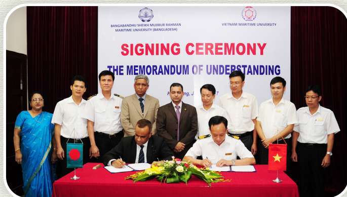
Signing of MoU