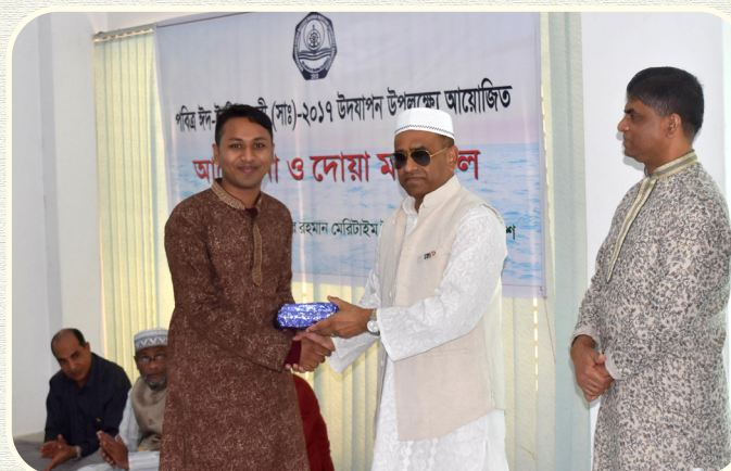
Handing over of Awards to the Best Essay Writer by Chief Guest