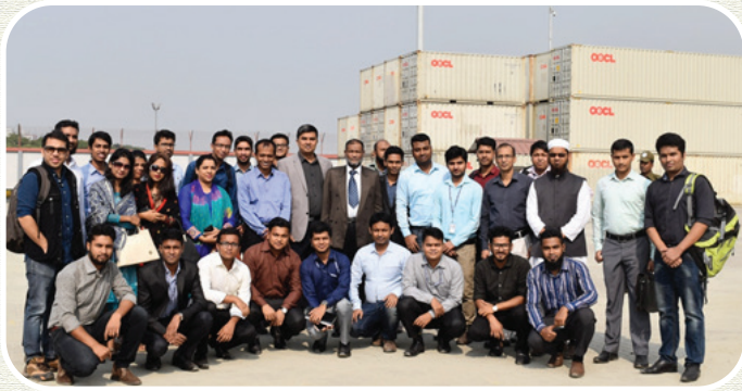
Faculty Members and Students at Pangaon Inland Container Terminal

With an aim to acquaint with the activities of maritime organizations, an Internal Study Tour was organized as usual for the 3rd batch students of both Master in Port and Shipping Management and LLM Maritime Law and the 1st batch students of Master in Maritime Business. The tour included visits to Dockyard and Engineering Works Ltd, Narayanganj, Department of Shipping, Bangladesh Inland Water Transport Authority and Pangaon Inland Container Terminal from 21- 23 Nov 17. The tour gave the students an opportunity to have an idea about the overall contribution of maritime organizations to our national economy.