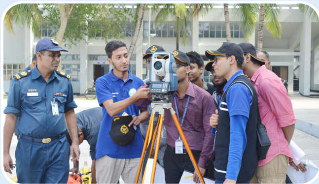
Field Training on Hydrographic Survey Instrument