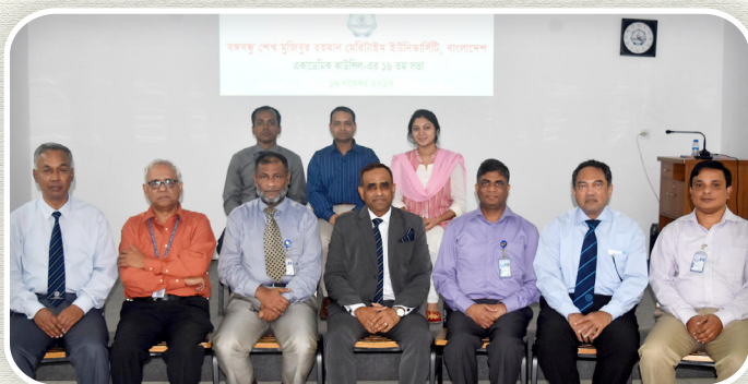
Members of the Academic Council

The 15th and 16th meetings of Academic Council were held at the university campus on 17 Aug and 19 Nov 17 respectively. These meetings were presided over by the Vice-Chancellor as usual. Various academic matters were discussed and decisions were taken subsequently.