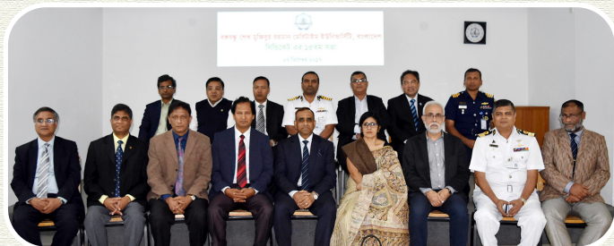
Members of the Syndicate