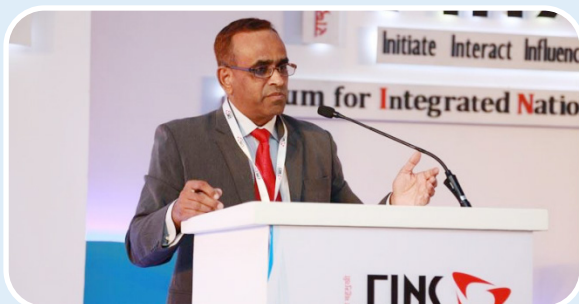
Vice-Chancellor of BSMRMU delivering his lecture in an International Conference held in Goa, India from 12 - 14 Oct 17, organized by India's Forum for Integrated National Security (FINS)