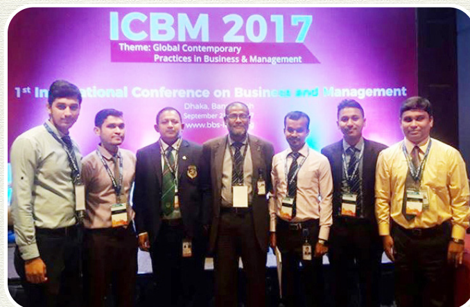
Participants of BSMRMU in ICBM 2017