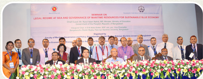
Chief Guest, Special Guests and Organizers

A seminar titled “Legal Regime at Sea and Governance of Maritime Resources for Sustainable Blue Economy” was jointly organized by the Faculty of Maritime Governance and Policy of BSMRMU, Bangladesh and Blue Economy Cell, Energy and Mineral Resources Division at the Auditorium of International Mother Language Institute in the capital on 22 Jul 17. Education Minister Mr. Nurul Islam Nahid, MP graced