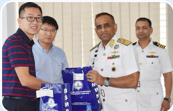
Memento Exchange with the Scientists of National Ocean Technology Centre, China on 23 Jul 17