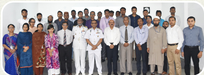
Participants and Organizing Team with the Chief Guest