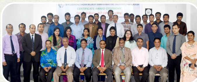
Course Members with Chief Guest and other Guests