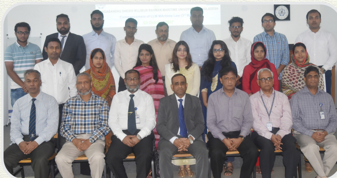
Students of LLM in Maritime Law with the Chief Guest