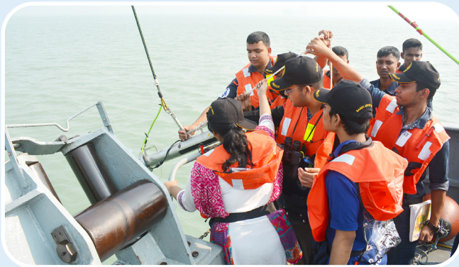
Onboard orientation with Hydrographic Equipments