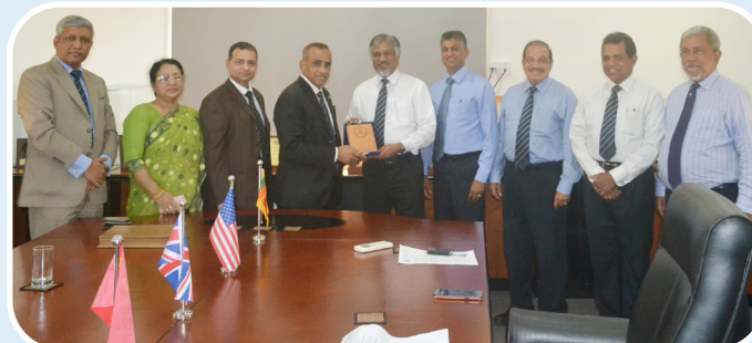
BSMRMU Delegation headed by Vice-Chancellor visited Colombo International Nautical and Engineering College on 02 Nov 17